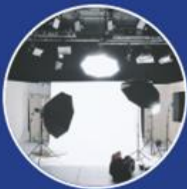
Pre-Media & Retouching