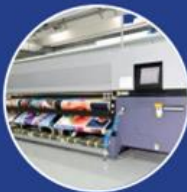
Large Format Printing & Finishing