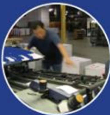
Bindery & Additional Services